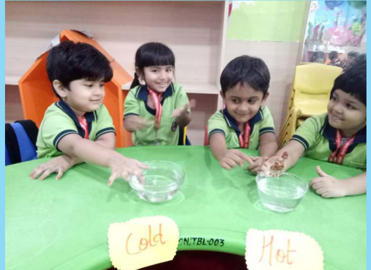
Why we shouldn't touch hot things