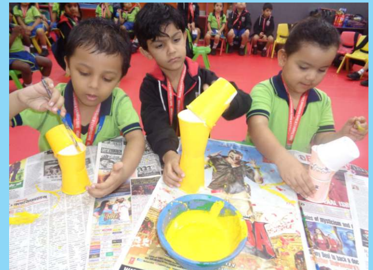
We are making giraffes