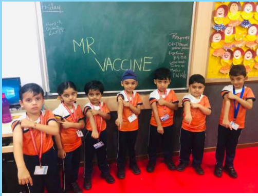
Brave little ones after MR vaccination