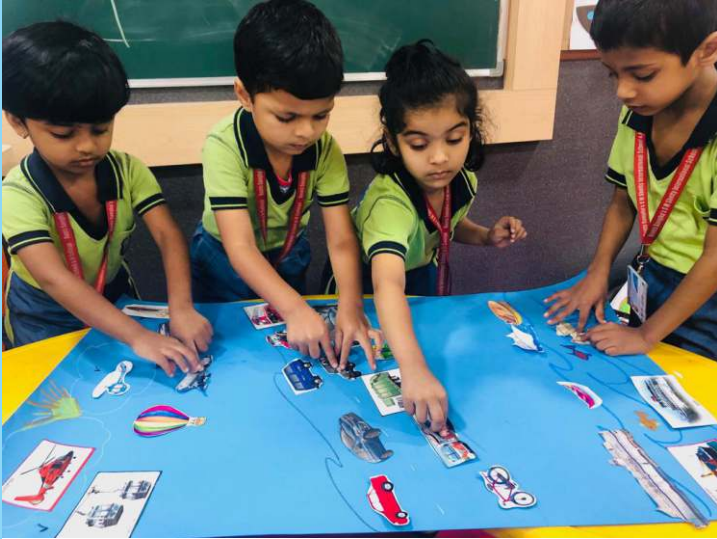
Mode of transport