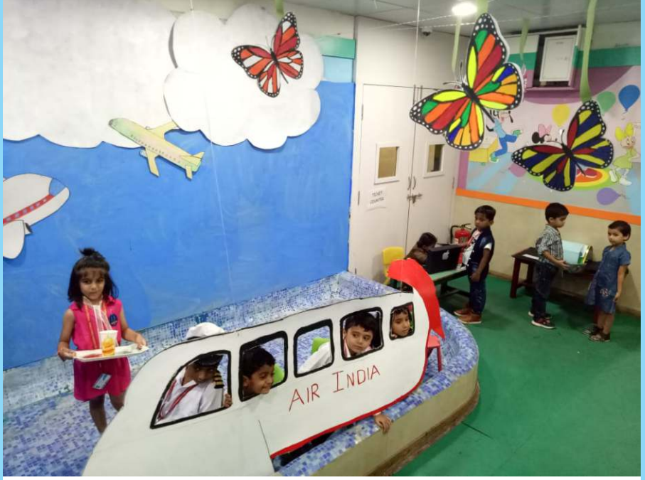
Boarding pass please