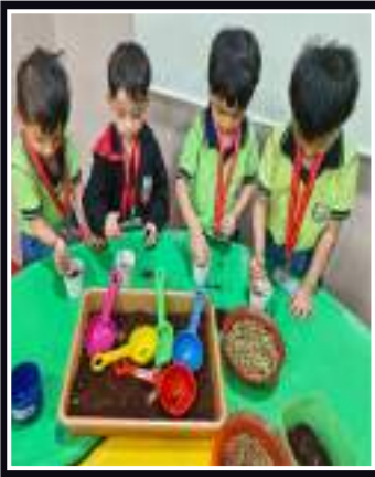
Germination of seeds