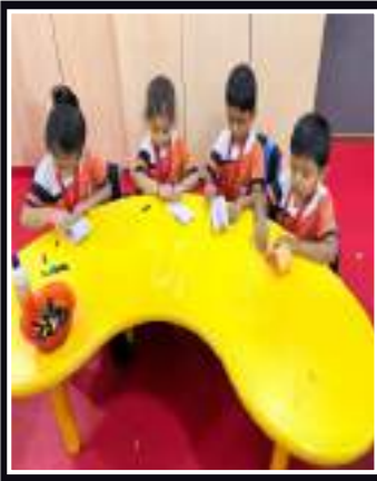
Fly High Fun