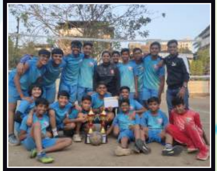
Our U-14 and U-16 boys received second place in a Volleyball Tournament which is organised by Don Bosco school Dombivli.

We are proud to share the achievements of our students at the Indo-Scot Global Inter school competition conducted on 5th and 6th December 2023 .